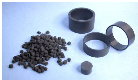
【Sample image of molded products】